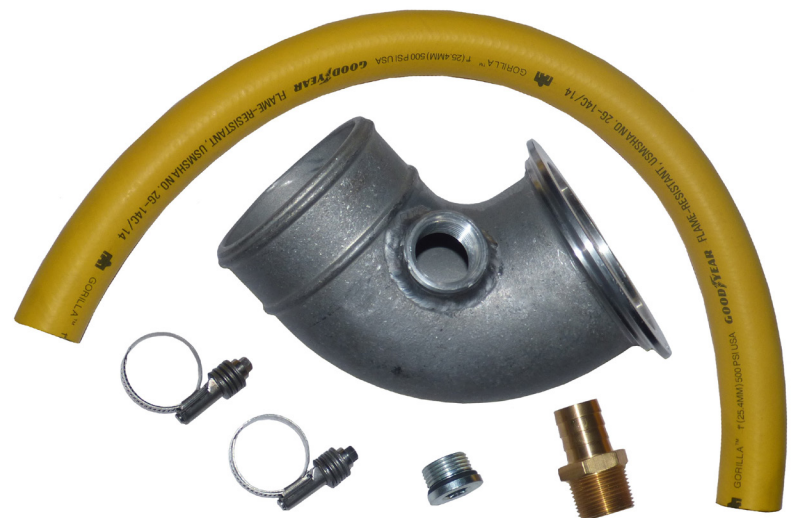
MIDC285-8823K ELBOW CONVERSION KIT, CAT N270/EL365, C-15

Accupart is now offering a solution to this issue by way of a conversion kit that allow you to change the compressor intake to positive pressure by utilizing the engine turbo air feeding the engine intake. Some rebuilders today are making it a mandatory change as part of the warranty offer on the air compressor. Order your kits today and stop your customers compressor from pumping oil permanently.